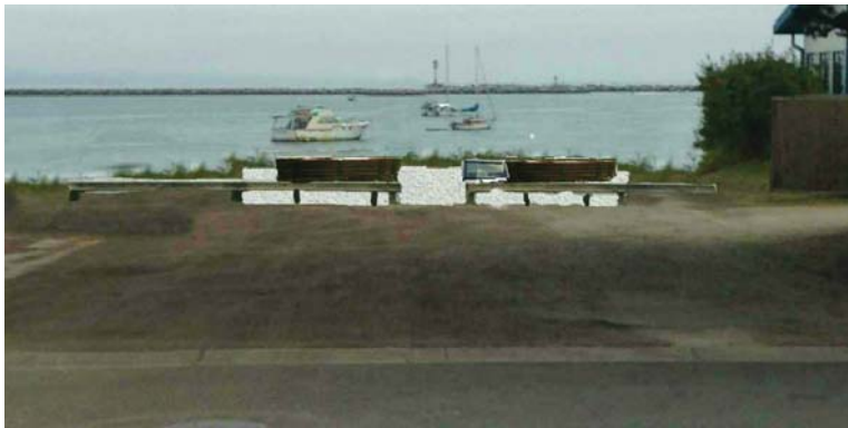
CONCEPTUAL VIEW - LOOKING WEST