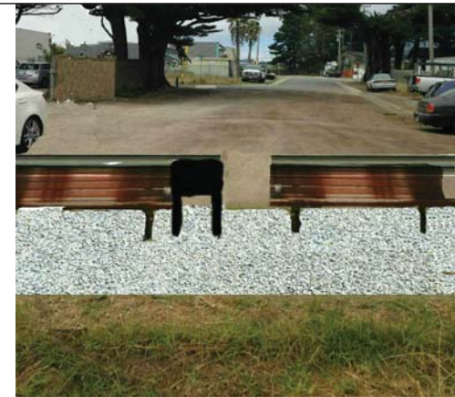
CONCEPTUAL VIEW - LOOKING EAST